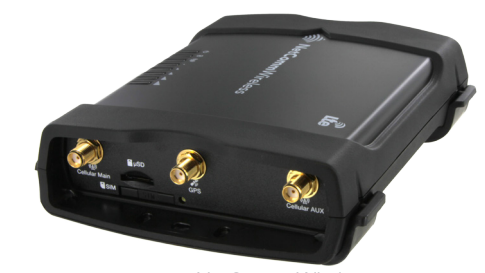
1 x NetComm Wireless 4G M2M Router (NTC-140-02)